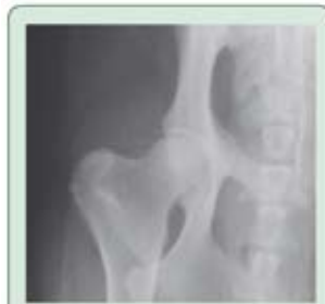
Normal hip joint.

made much worse by cold damp autumn and winter weather. On x-ray the new bone can often be clearly seen, as in the case shown below (see arrows).