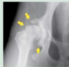
Arthritic hip joint (in a dog with hip dysplasia). Note the fluffy new bone (arrowed) around the joint

There are several causes of arthritis: The commonest is a lifetime of activity, simply resulting in wear and tear on the joints. Arthritis may also occur following joint trauma, or secondary to malformation of a joint as in hip dysplasia – see below left for x-rays.