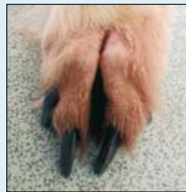
Foot chewing in a dog

gies is intensely itchy skin. Signs include face rubbing, paw chewing, recurrent ear problems, persistent licking and over grooming. Food allergies can present both with symptoms of diarrhoea and/or dermatitis (itchy skin).