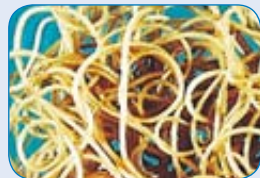
Typical roundworms e.g. Toxocara canis