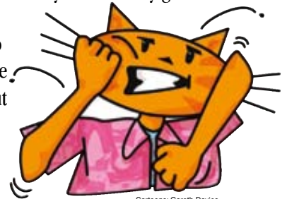
Cartoons: Gareth Davies

can be very helpful in devising a suitable treatment. The best form of treatment is to minimise the exposure of the pet to the allergen. Flea saliva allergies are greatly improved by effective flea control, whilst food allergies may be improved by a new diet that avoids the problem. Inhaled allergens are more difficult to control, but new forms of medication can be really helpful in reducing itching. If your pet gets itchy for no obvious reason or has a sensitive stomach, it could be an allergy. Let us give your pet a check-up; they may be eternally grateful!