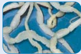
Tapeworm segments e.g. Taenia taeniaeformis

Did you know that when you give your pet a wormer, its only job is to kill any worms present at that time?