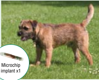
Microchip implant x1

NOW you see them, now you don't! Sadly it's all too easy for pets to go missing and if this happens it could mean days or weeks of worry for all involved. However the good news is that microchip implants now offer a far more reliable method of identifying your pet than the traditional collar and tag (which can all too easily become detached and lost). A range of pets can be microchipped, including dogs, cats, horses, small pets, birds and even fish! However the system is most commonly used by dog and cat owners.